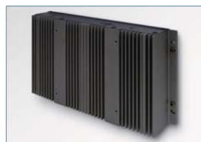
Flush mounting holes on left/right hand sides.