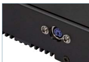
Option PS/2 port