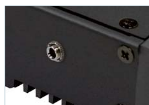
Option Audio-out port