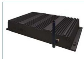
External wireless antennas boost the performance in connectivity.