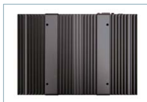
100 x 100 mm VESA mounting holes in center.