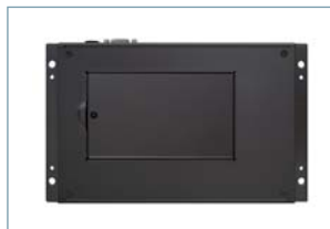
HDD door in bottom for easy service.